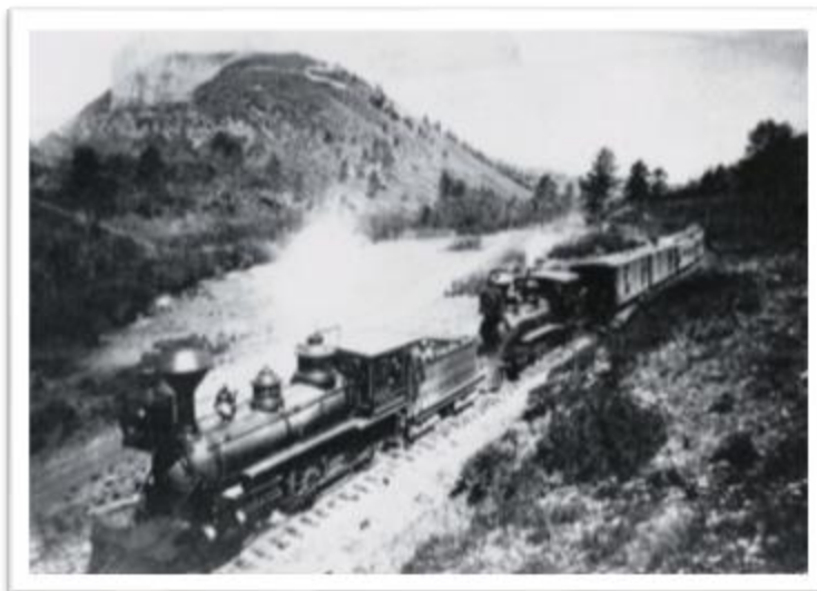
The Denver & Rio Grande Railroad on La Veta Pass: Locomotives No. 99 and 46 descend the pass below Dump Mountain eastbound.